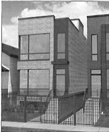
Some photos may be virtually staged

Detached Single Status: CLSD Area: 8024 Address: 1927 W Erie St , Chicago, Illinois 60622 Directions: ERIE, WEST OF ASHLAND , EAST OF DAMEN Sold by: Ivona Kutermankiewicz (115606) / Berkshire Hathaway Lst. Mkt. Time: 3 HomeServices KoenigRubloff (10900) Closed: 03/06/2017 Off Market: 09/09/2016 Year Built: 2016 Dimensions: 25X124 Ownership: Fee Simple Corp Limits: Chicago Coordinates: N:700 W:1927 Rooms: 12 Bedrooms: 6 Basement: English Utility Costs: MLS #: 09336214 Lst Date: 09/07/2016 List Dt Rec: 09/07/2016 Contract: 09/09/2016 Financing: Conventional Blt Before 78: No Concessions: Contingency: Curr. Leased: List Price: $1,449,900 Orig Lst Price: $1,449,900 Sold Price: $1,449,900 Subdivision: Township: Lake View Model: County: Cook # Fireplaces: 2 Parking: Garage Bathrooms: 3 / 1 (full/half): Master Bath: Full Bsmnt. Bath: Yes # Spaces: Gar:2 Parking Incl: Yes In Price: